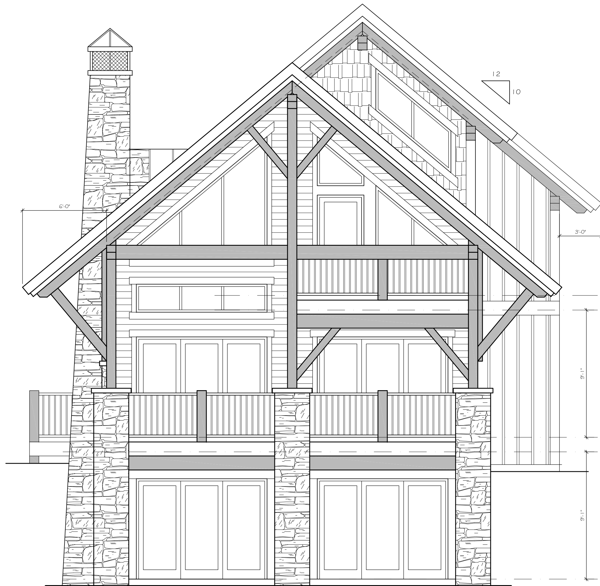
1 A? REAR ELEVATION 1/4" = 1'-0"